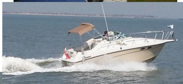
Flying Visit sets off to chase Dom