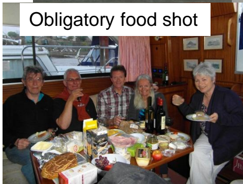
Obligatory food shot