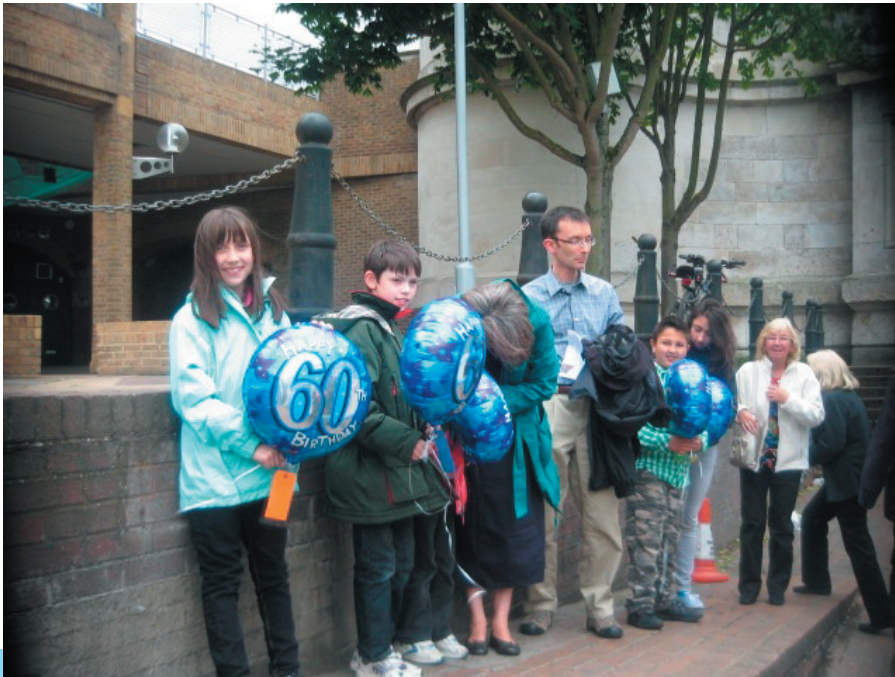
Club members waiting for the balloon release