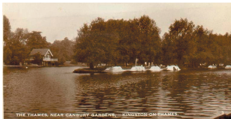
Stephens Ait circa 1953

It’s the season finale and our Awards night!