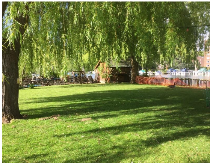
Now Ready To Enjoy